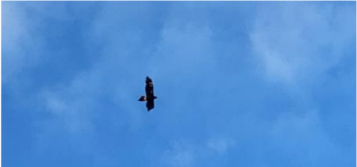
Wedge Tailed Eagle flying over my property.