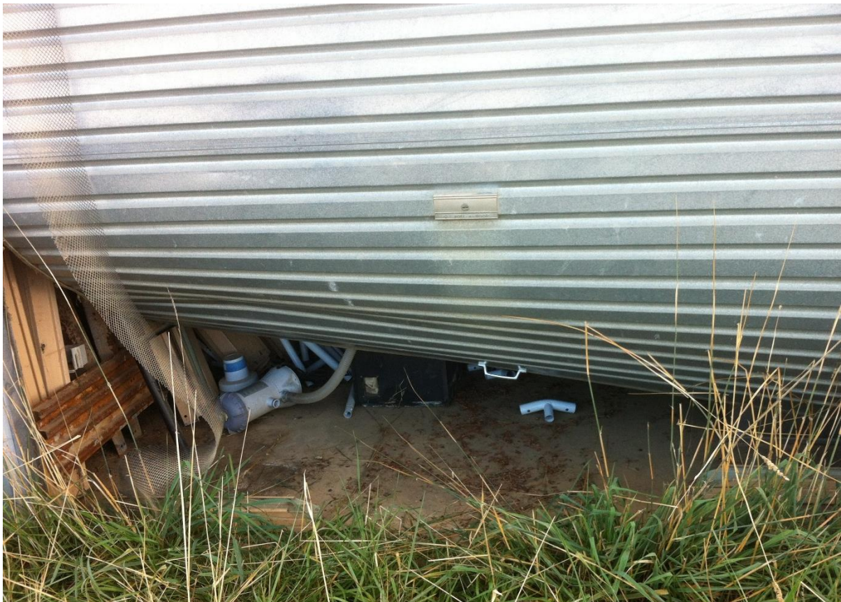
Thieves rammed roller door of shed.

Bringing 200 workers and trucks increases the risk of further destruction to life and property.