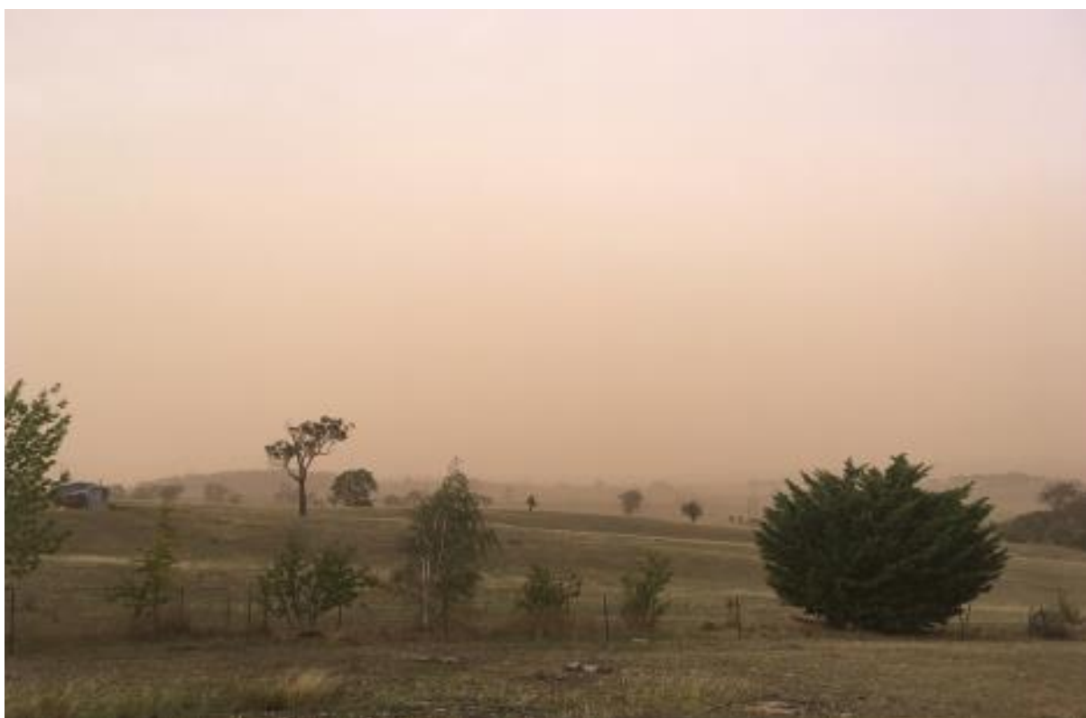
Dust storm over proposed site.