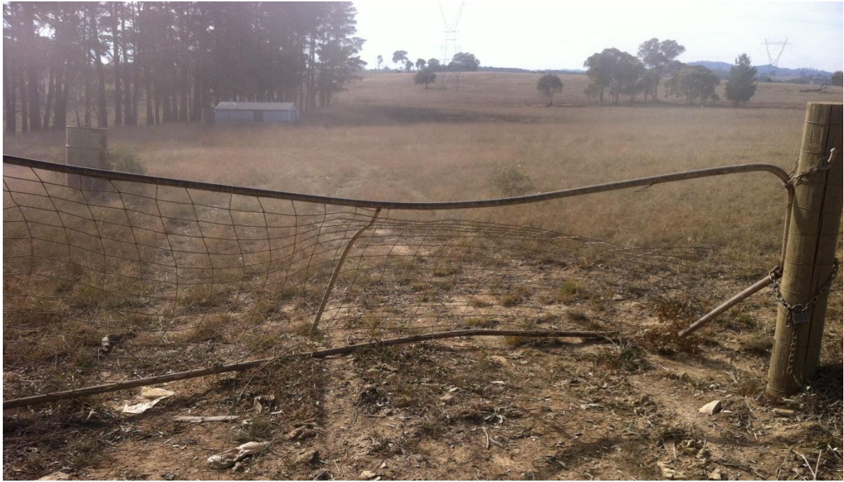
11/04/2016 Thieves rammed one of my gates off its hinges (Corner of Tintinhull Road and Tallagandra Lane)