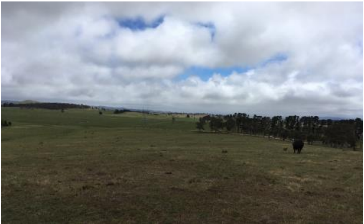
Photos near the proposed building site for my eldest son and his wife (East of R5). Tallagandra Lane on the right, (turn off to Tintinhull road at the end of the trees), going down through the valley, the proposed Springdale site, directly ahead.