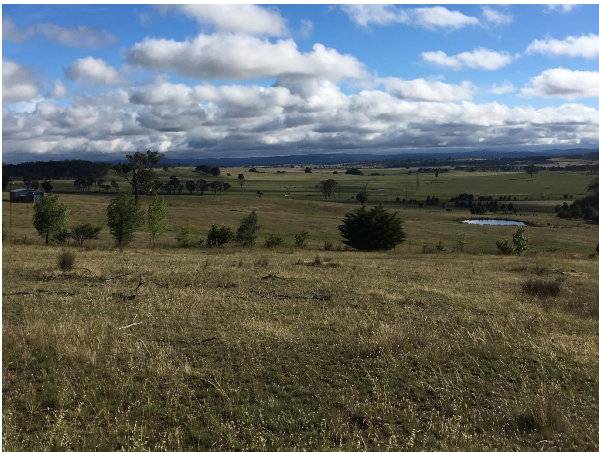
Looking North from paddocks below R5