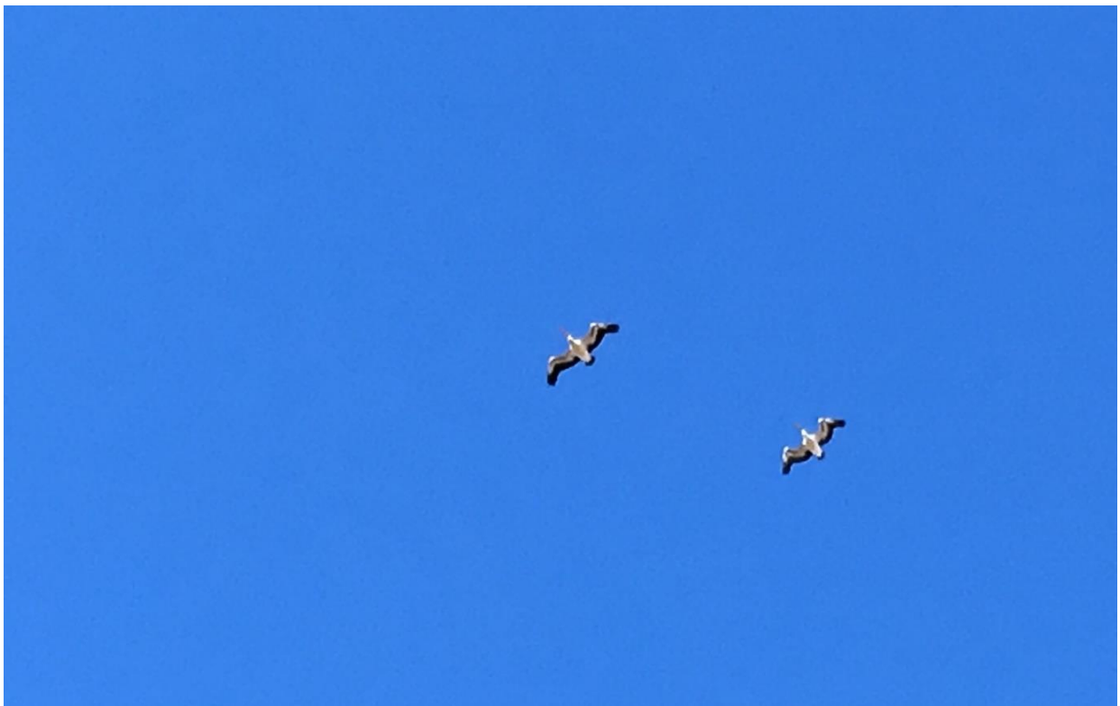
Pelicans flying over property