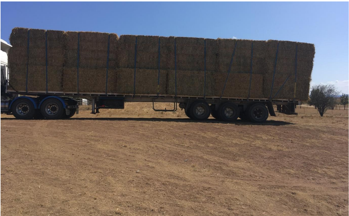
Hay purchased during drought.