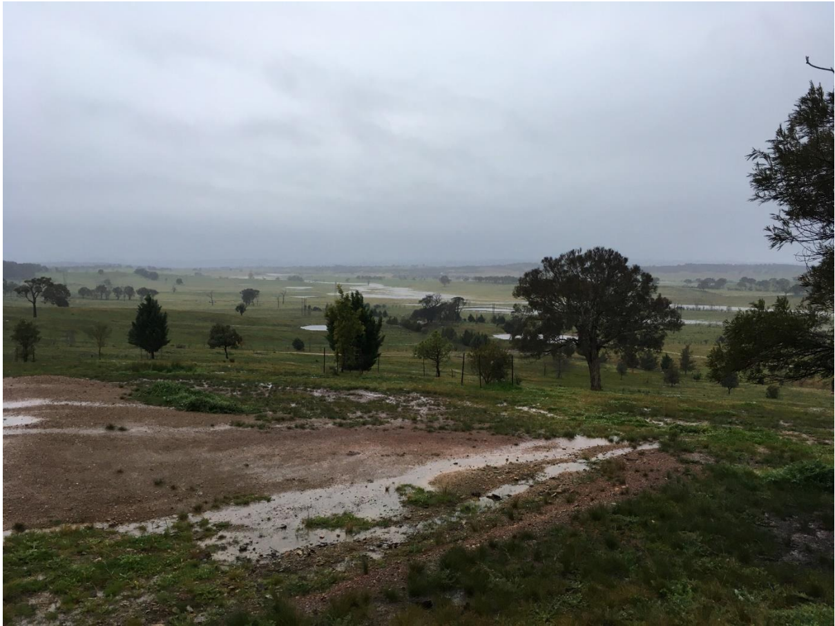
Flooding of Springdale area 2020.

I can see the wind farms on hills near Collector in the distance, I look over the hills near Goulburn and the hills of Lake George and Mack's Reef road towards the coast, I can see Canberra's Black Mountain tower and the beacon on Mount Ainslie used to flash in my bathroom window at night.