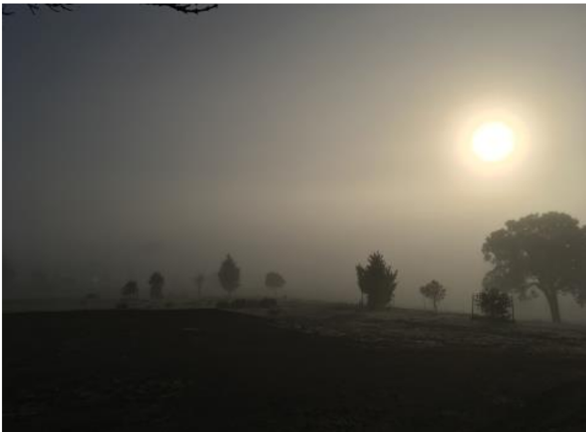
North towards the Proposed Solar Power station, not much energy generated that day!