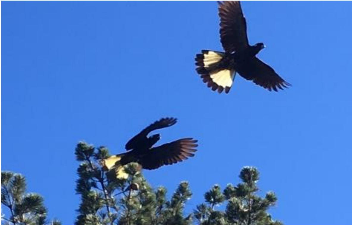
Black Cockatoos feeding in my pine trees.