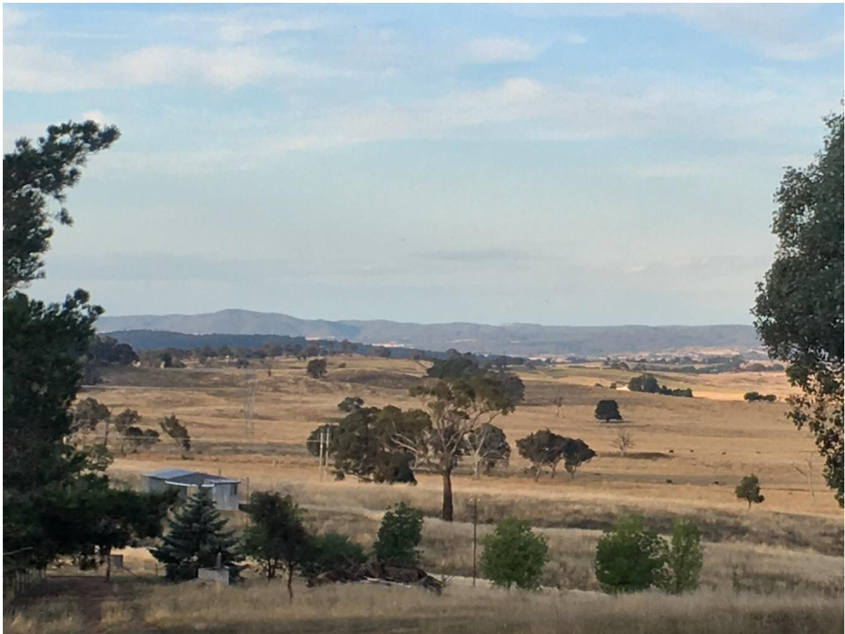
My shack in the foreground with windows that overlook most of the site.