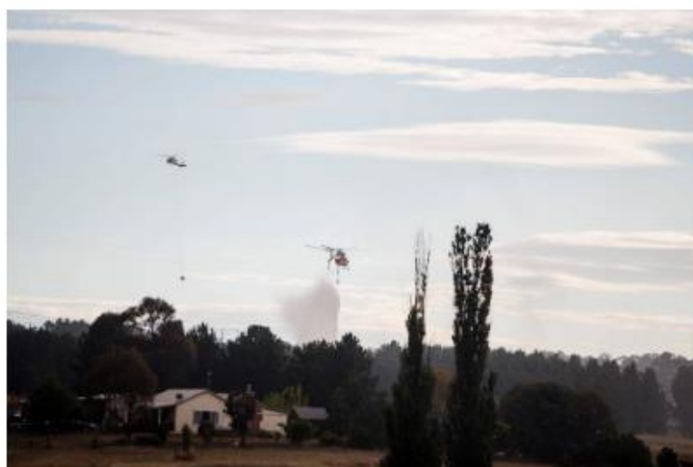
Eight aircraft were involved in holding the fire east of Sutton Road

Residents should still be on high alert, but firefighters have slowed the spread of the grass fire.