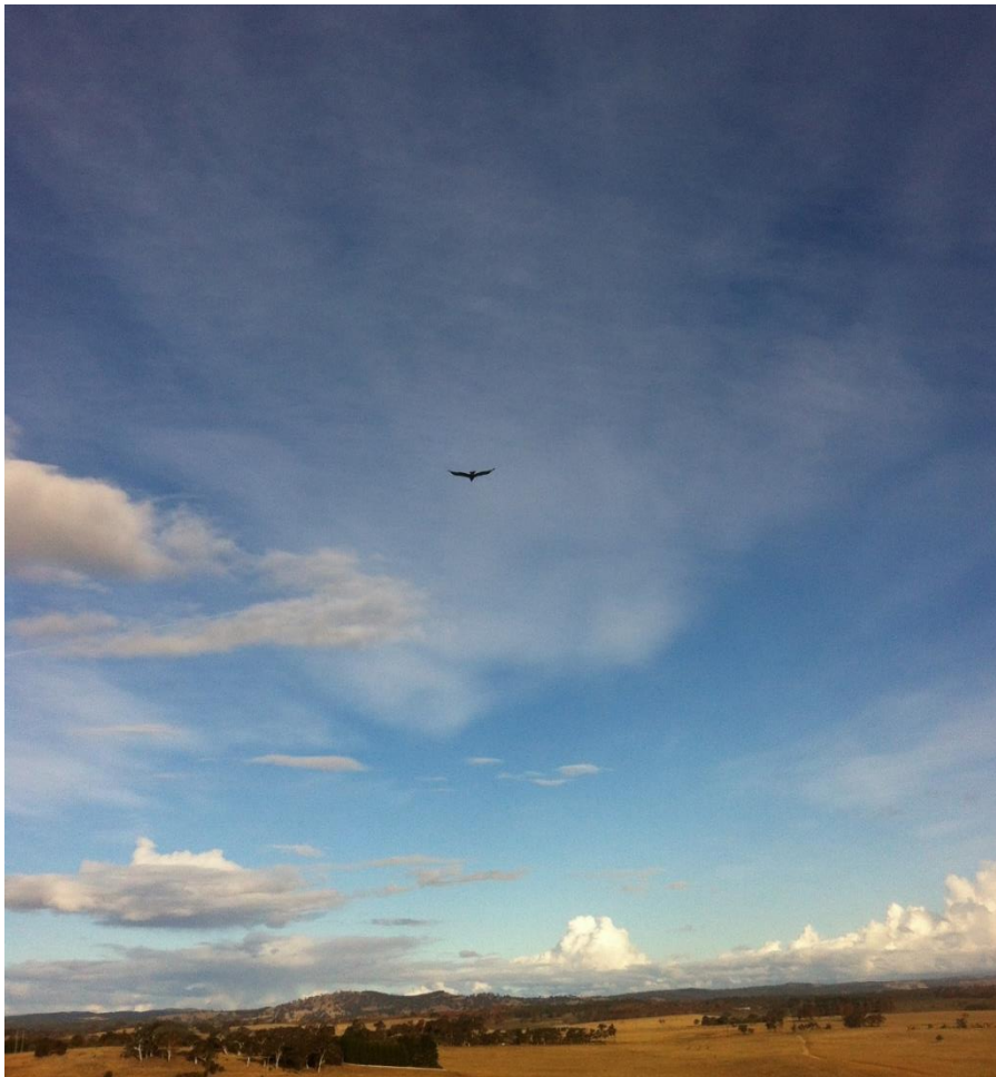
Some of the birdlife photographed from my property. So also resident or visiting Springdale site.