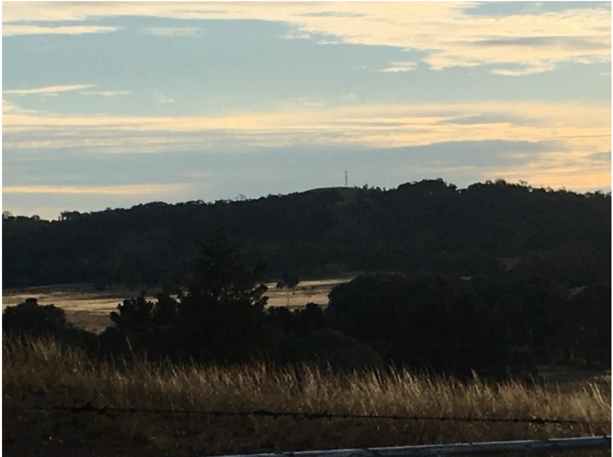
Oak Hill Lookout from my back gate,