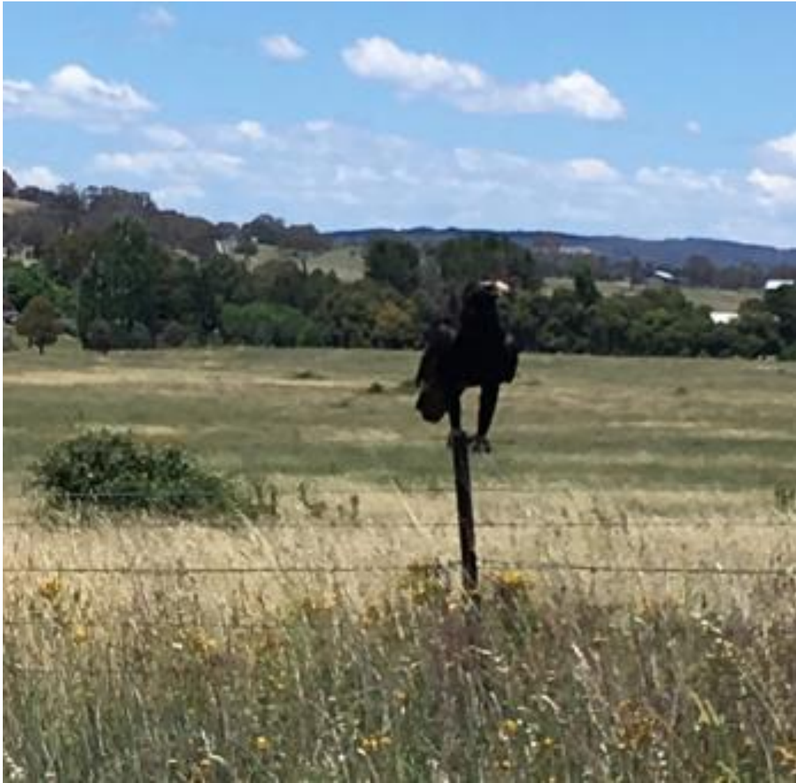
East Tallagandra Lane, Traffic from Proposed Solar Farm could threaten these wedge tailed eagles.