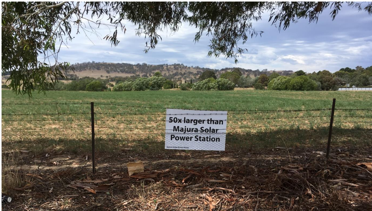
In 2018 many local landholders assisted with demonstrating their objection to the proposed Solar power plant, photo taken just North of Sutton on Sutton Road.