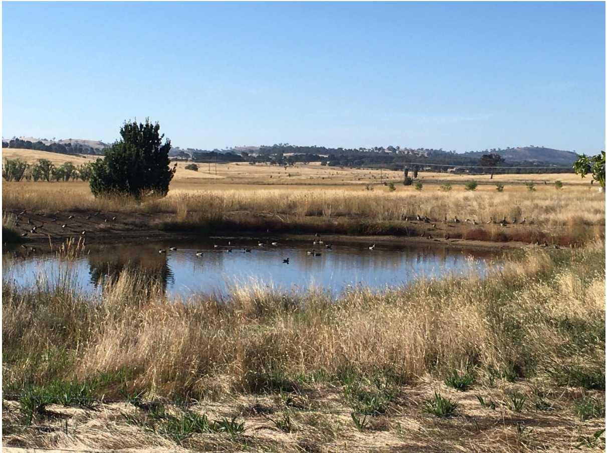
Ducks on one of my dams, RES are planning to fill in their dams.