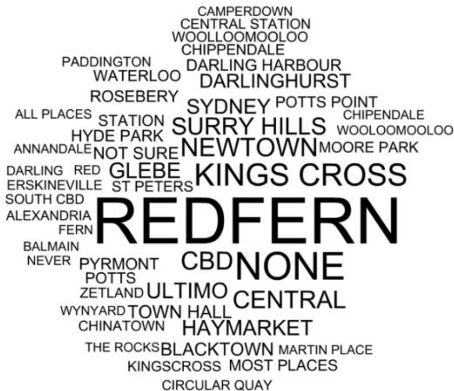
FIGURE 28: WHERE IN THE CITY OF SYDNEY DO YOU FEEL LEAST SAFE?

To dump 600 international students mostly from Asia, who are already terrified (see above), next door to 62 indigenous families from disadvantaged backgrounds without ANY social integration plan is ill-considered and completely reckless.