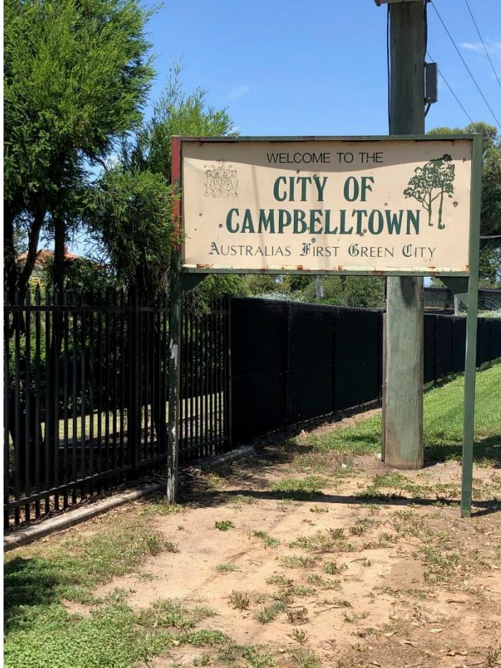
WELCOME TO THE CITY OF CAMPBELLTOWN AUSTRALIAS FIRST GREEN CITY

Campbelltown currently has a point of difference within the South West Suburbs, a rare surviving colonial landscape dating back to our history's notable pioneers - The Scenic Hills.