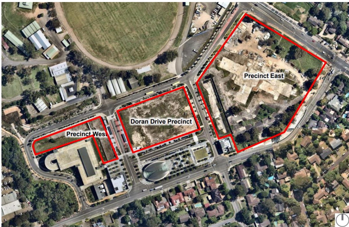
Figure 2 Hills Showground Station Precinct – Doran Drive Plaza Precinct in center