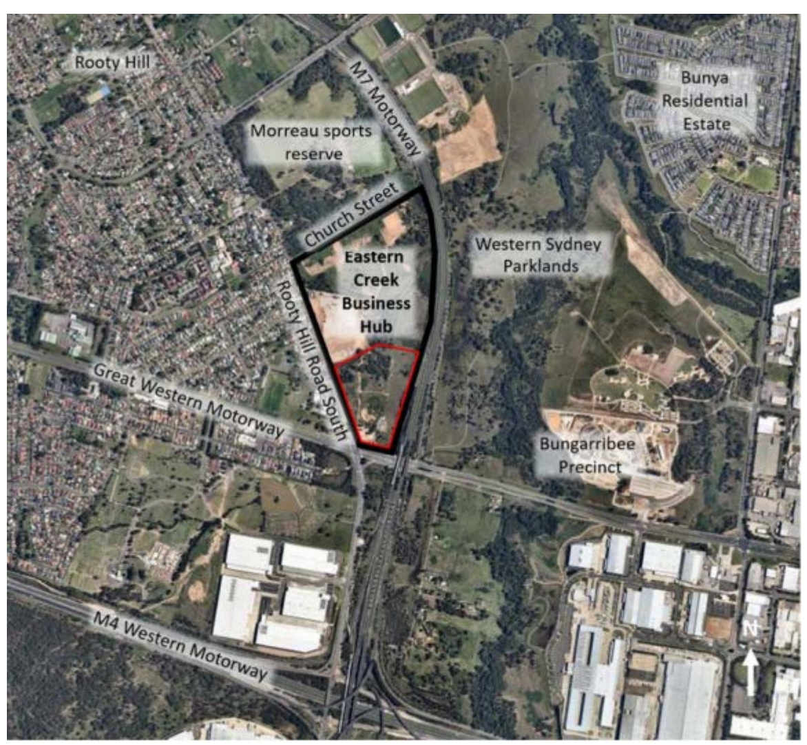
Figure 1: The Eastern Creek Business Hub - Concept Approval Site (black outline) and the SSD Site Lot 1 (red outline)

8. The modification to the Concept Approval is to facilitate the SSD 8858. This SSD Site is as described by reference to lot and DP in the SSD Application, and is known as Lot 1 of the Rooty Hill Precinct of Western Sydney Parklands. It is Stage 2 of the Eastern Creek Business Hub, located on the corner of Rooty Hill Road South and the Great Western Highway. The M7 Motorway is to the east, see Figure 1 below: