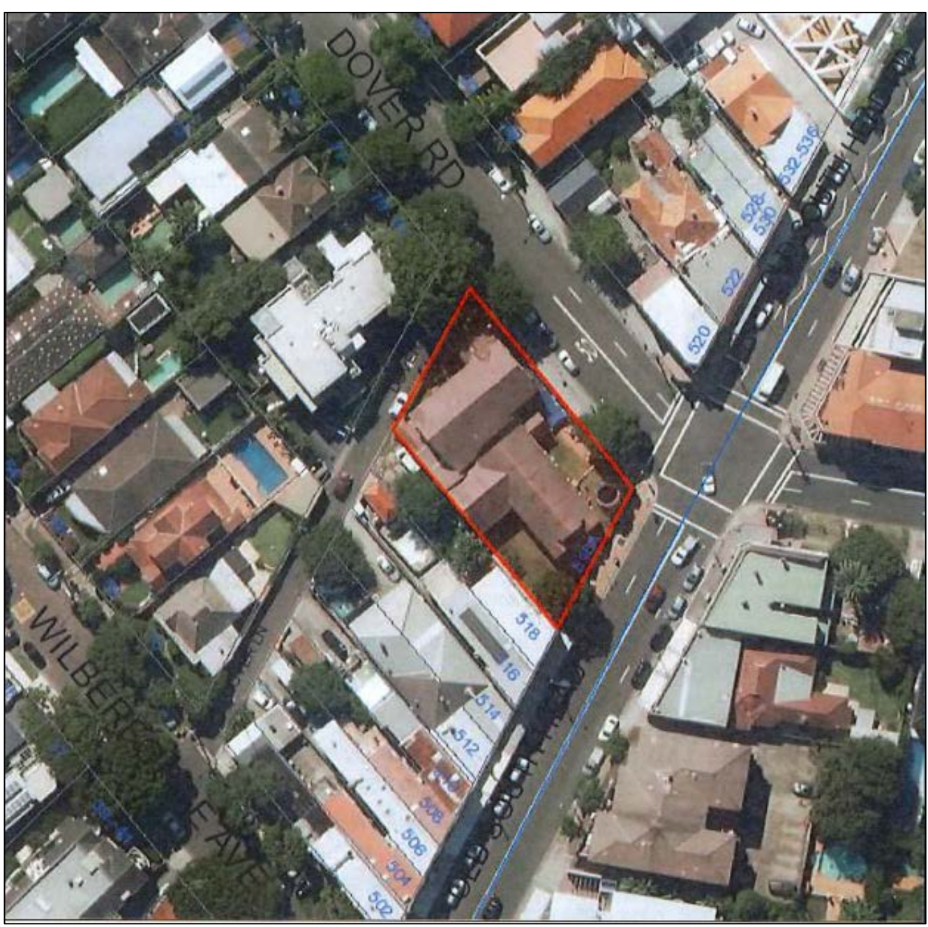
Figure 1: Aerial photograph showing the subject Site outlined red.