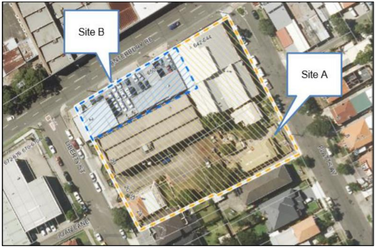
Figure 2: Site A and Site B (Source: Department's referral letter to the Commission, dated 21 December 2018)