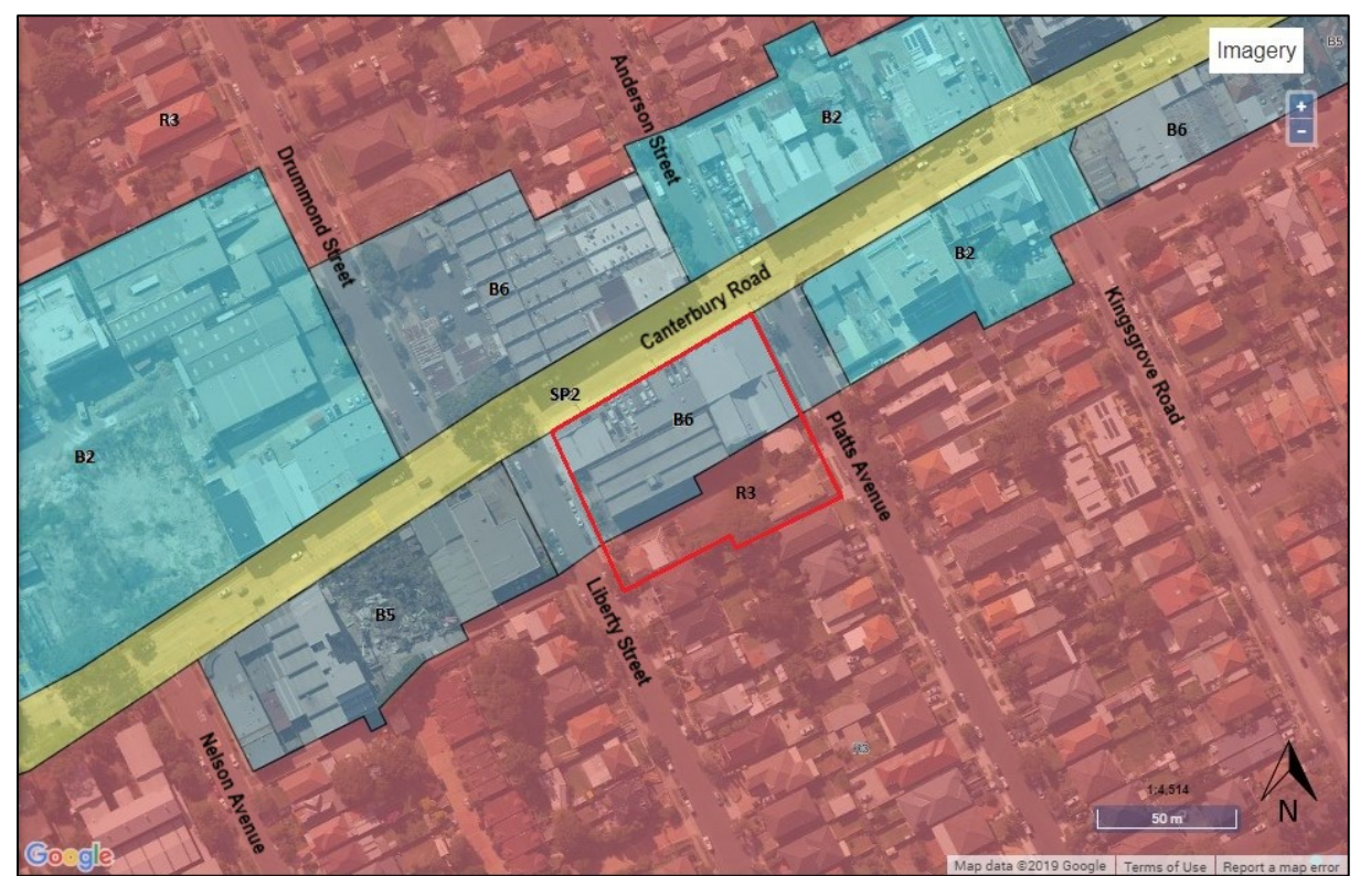
Figure 1: Site location and zoning

The Site is legally described as Lots 1, 2 and 4 DP5208, Lots A and B DP383957, Lots 1 and 2 DP514813 and Lot 51 DP6042, and is located at 642-644, 650-658 Canterbury Road, 1-3 Platts Avenue, 2, 2A, 2B and 2C – 2D Liberty Street, Belmore, within the Canterbury-Bankstown Local Government Area (LGA) (refer to Figure 1).