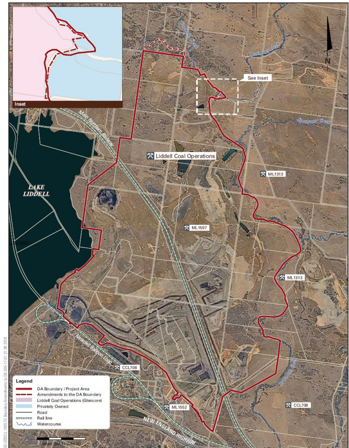
Figure 2 – Site and proposed boundary modification