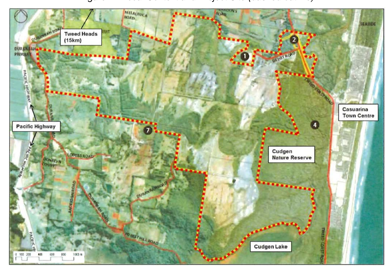
Figure 2 - Local Context and Project Site (dashed outline)