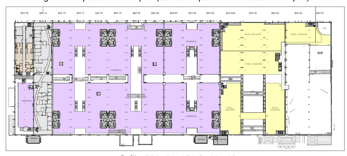
Figure 4: Proposed first floor plan