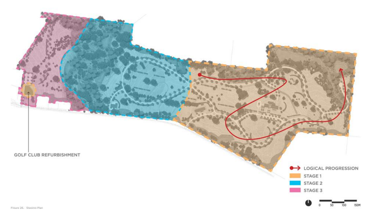
Figure 3: Indicative Development Staging Plan.