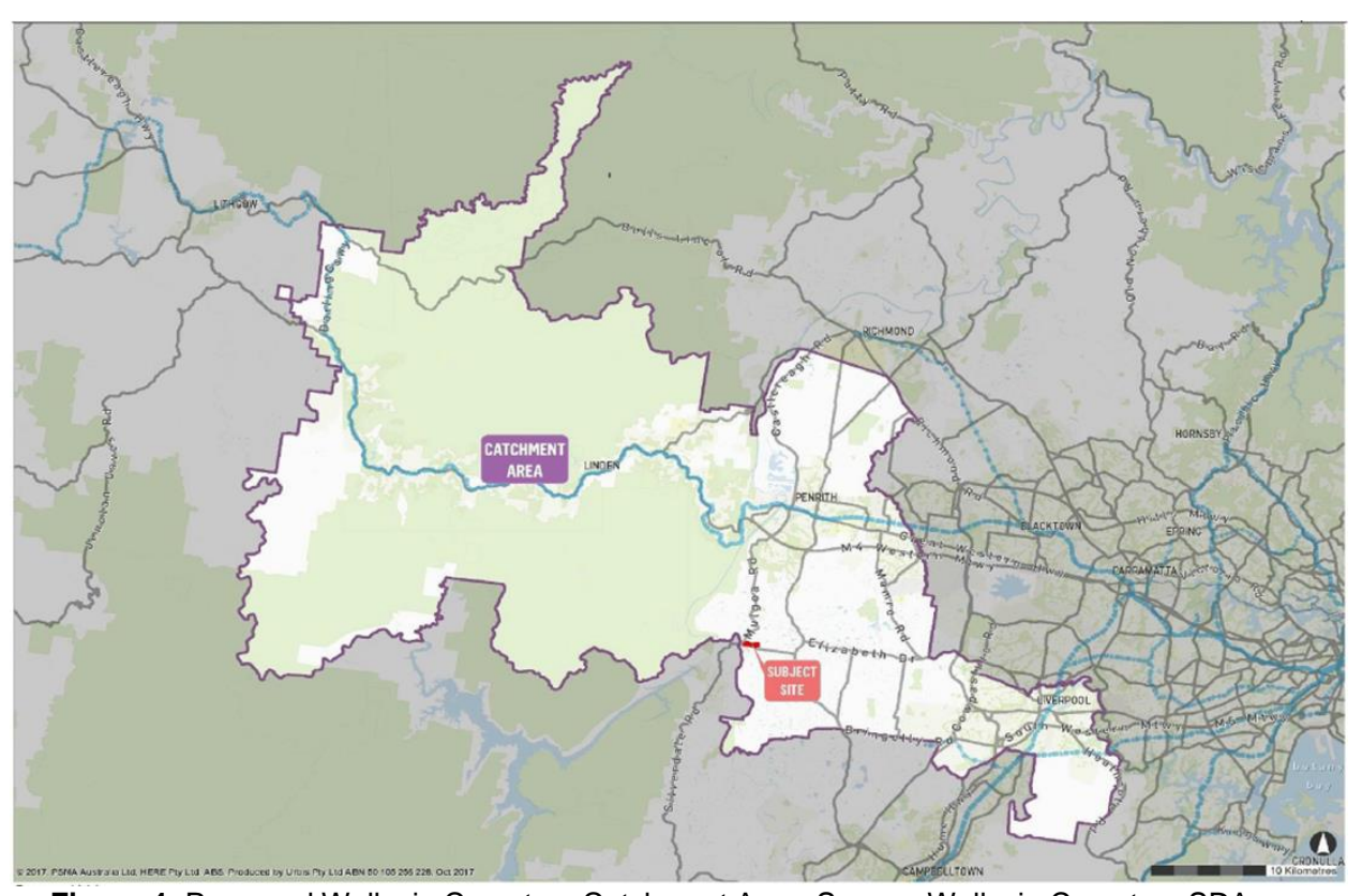
Figure 4: Proposed Wallacia Cemetery Catchment Area.

18. The SDA finds that: "Within the Catchment Area, it is projected there will be some 45,000 deaths over the period 2017 to 2032. Assuming all residents are buried within the Catchment Area, around 10,370 burial sites will be required in the catchment area over the period. This represents around 41% of the current supply of burial plots and 6% of current and proposed supply. The current stock of burial plots in the Catchment Area would be fully absorbed in approximately 31 years. It is noted that with the additional 123,490 proposed burial plots, stock would be fully absorbed in approximately 102 years (2119), allowing for an additional 71 years of supply".