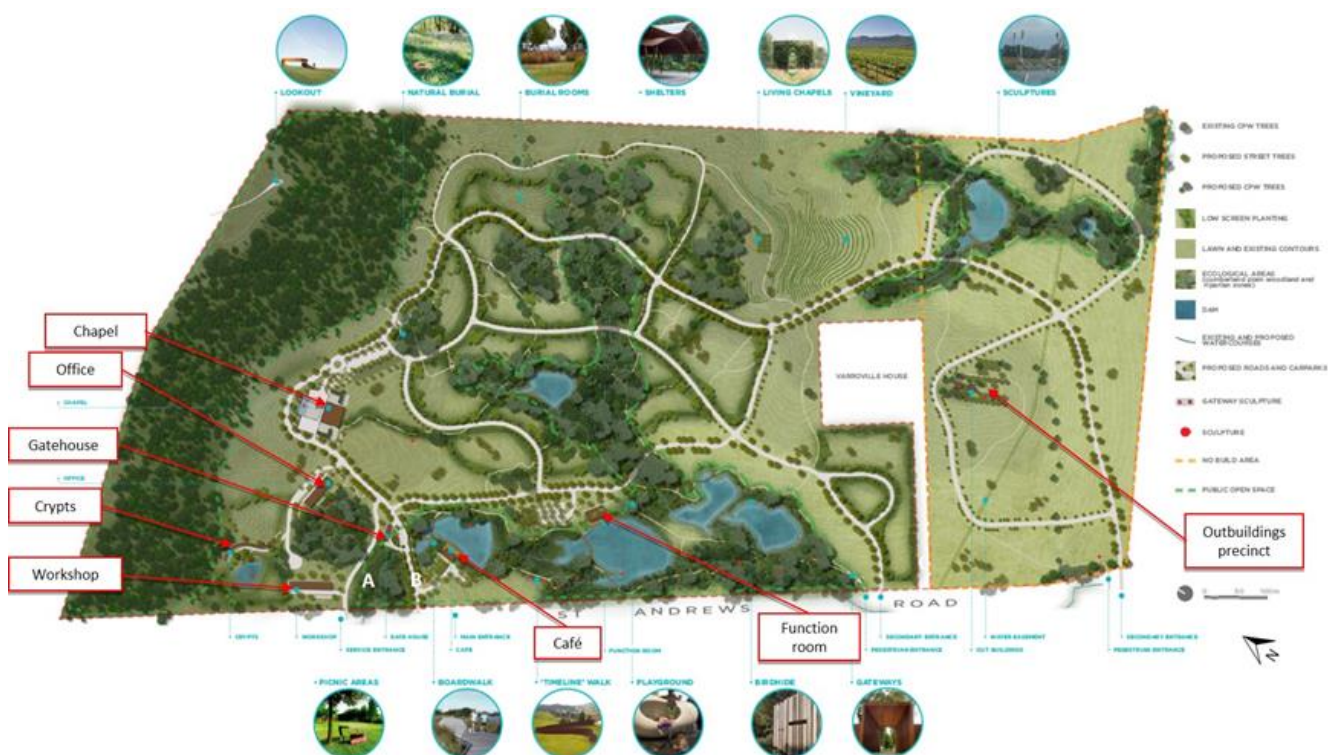
Figure 3: Proposed Development Masterplan.