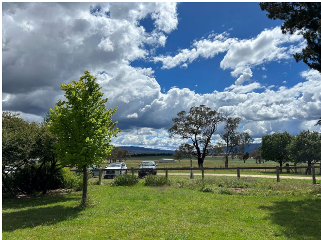
Looking northeast towards site from the R7 dwelling