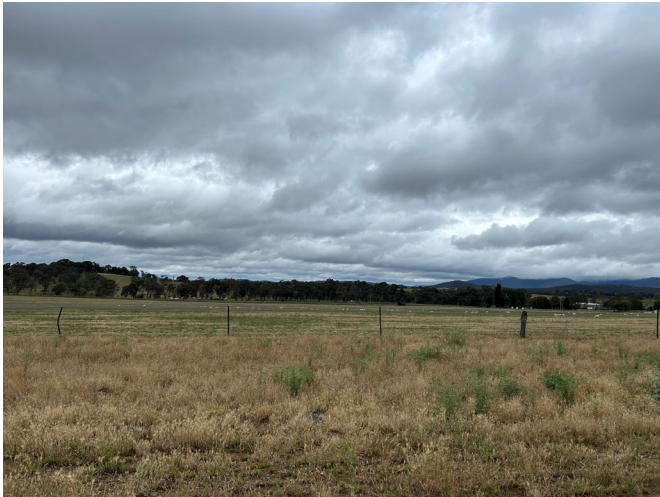
Looking north towards the northern setback and proposed laydown area.

North-east boundary of the proposed array, nearby the location of the proposed construction compound