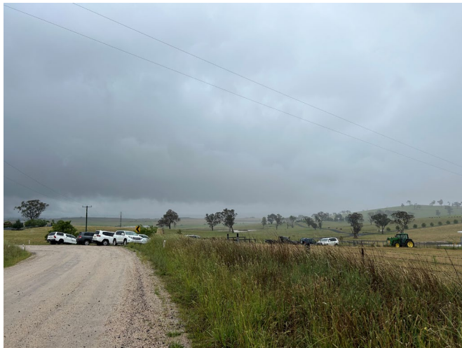
Looking at the southeast corner of the site, towards R5