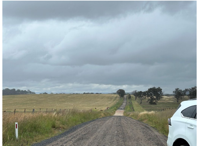
Looking north along Brewongle lane