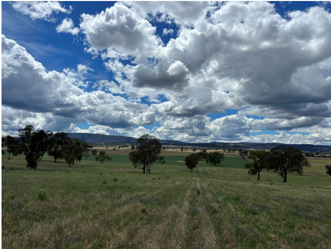
Looking east across to the site