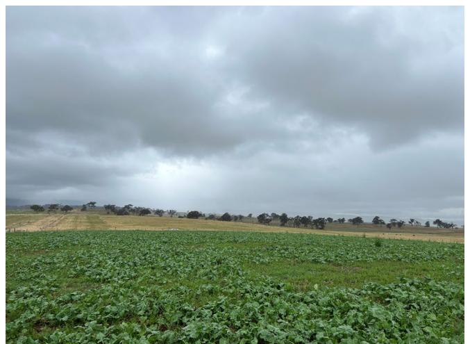
Looking west towards the proposed access point and substation