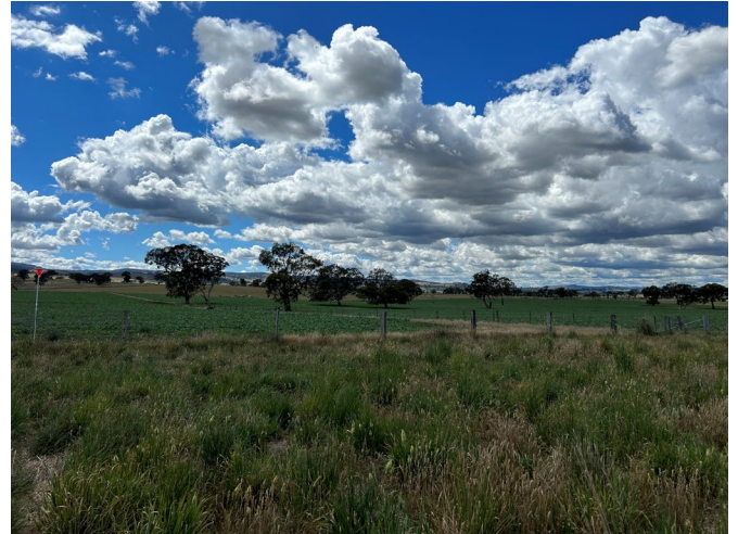
Looking southeast along the site