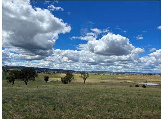
Looking southeast to the southern boundary of the site