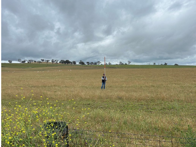
Community member standing with height pole