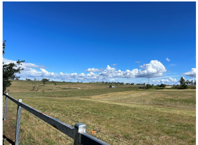
A closer look of the site from R4