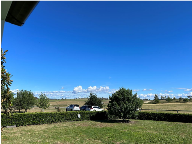
Looking northwest to the site from the R4 dwelling