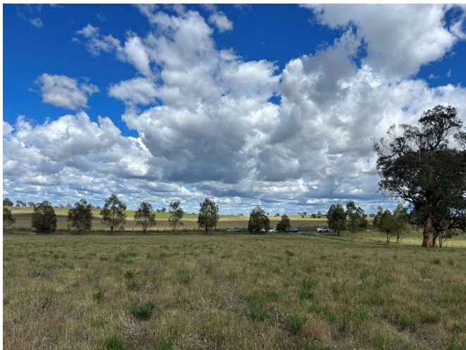
Looking west to the site across Brewongle Lane