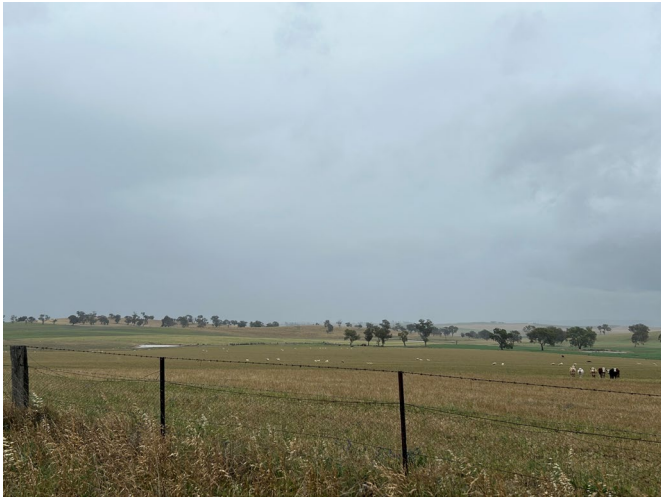
Looking south-west along the site

Viewing the site from the eastern boundary along Brewongle Lane.