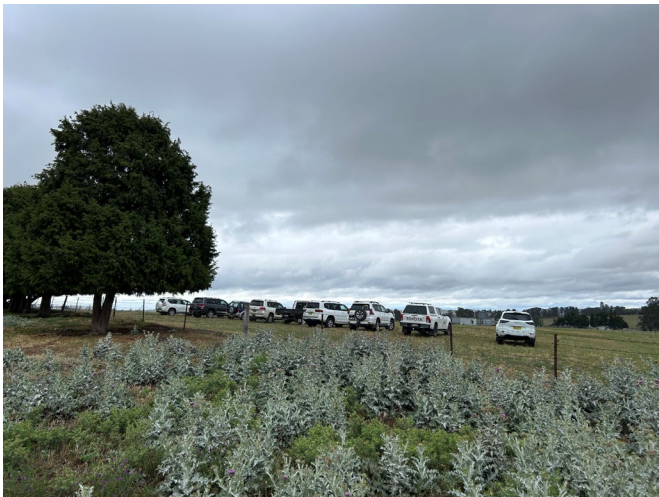
Site inspection meeting point. Looking north to proposed setback.

North-west boundary of proposed array; south of the proposed northern setback.