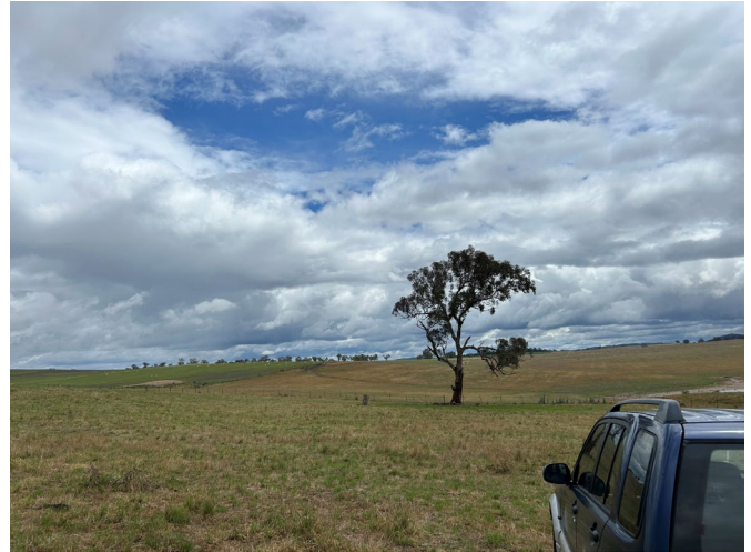
Looking north over the site