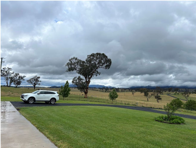
Viewing the south of the site from the R5 dwelling