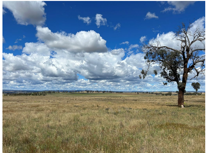
Looking west to the site in the distance from the location of a potential dwelling