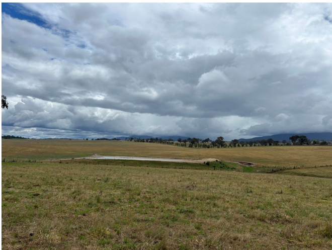
Looking north over the site from near the southern boundary