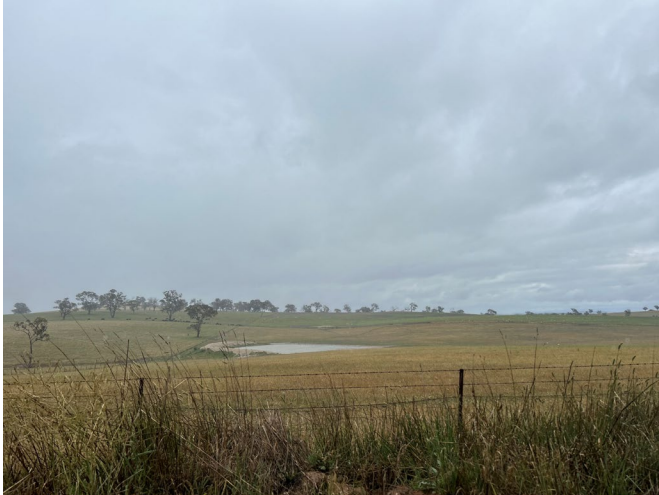
View of a farm dam, looking west across the southern boundary