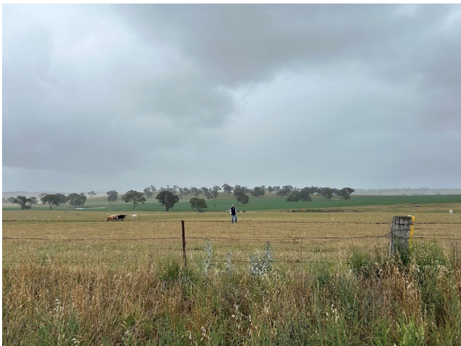
Looking west across the site. Community member marking approximately 30m from the eastern boundary.