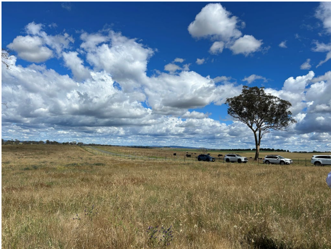
Looking northwest to the site in the distance