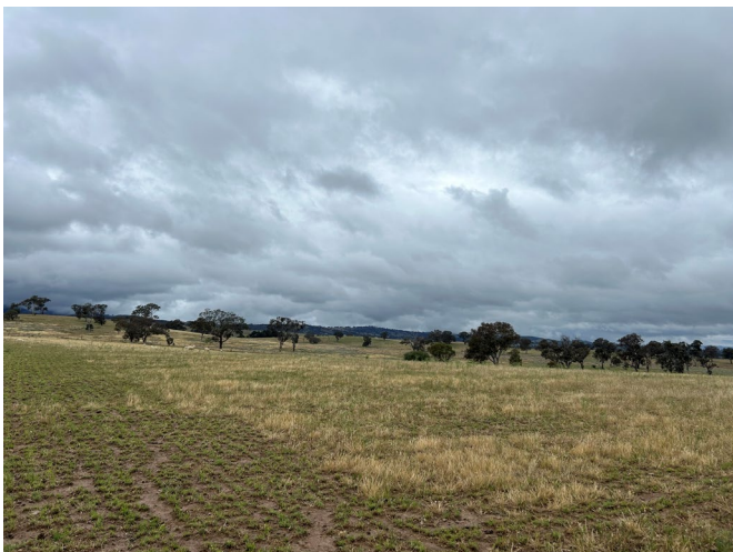
Looking east towards the eastern boundary along Brewongle Road.