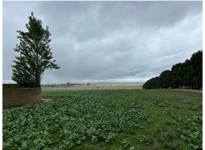
Looking east to the western boundary with R7