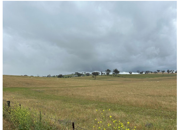
View of R5 looking southwest across the site