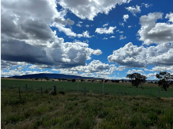
Looking east at the western boundary of the site.