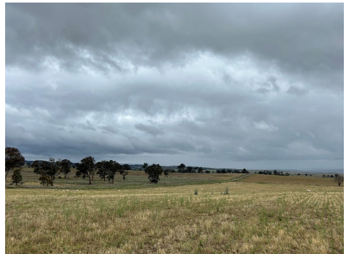
Looking south along the eastern boundary of the proposed array.