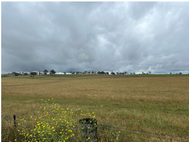
Looking west across the site