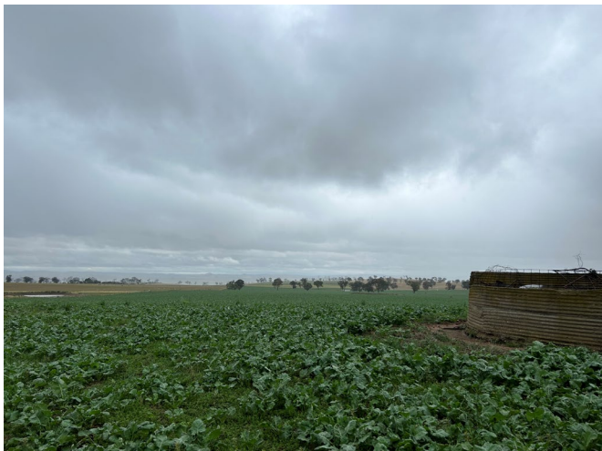
Looking south over the proposed array