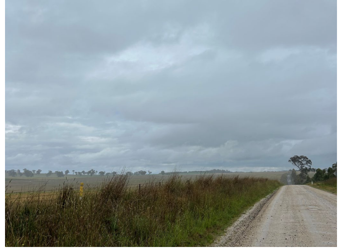
Looking north along Brewongle Lane