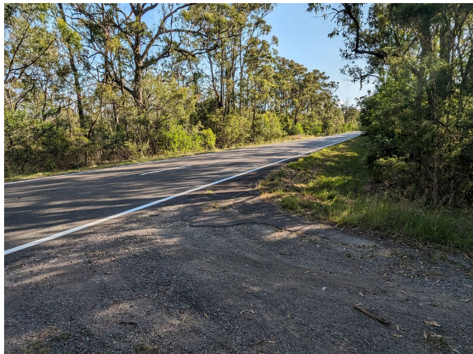
Viewing the intersection

The intersection of Deep Creek Road and The Buckets Way