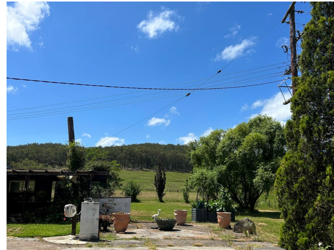
Looking towards the proposed access road