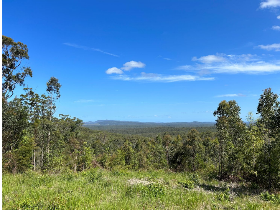
Observing the surroundings of the proposed quarry from a point of high elevation