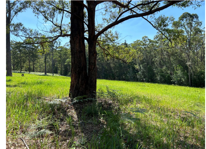
Observing a section of the proposed quarrying area