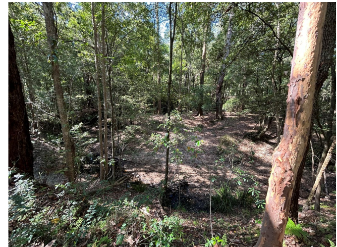
Looking at the site of the proposed creek crossing