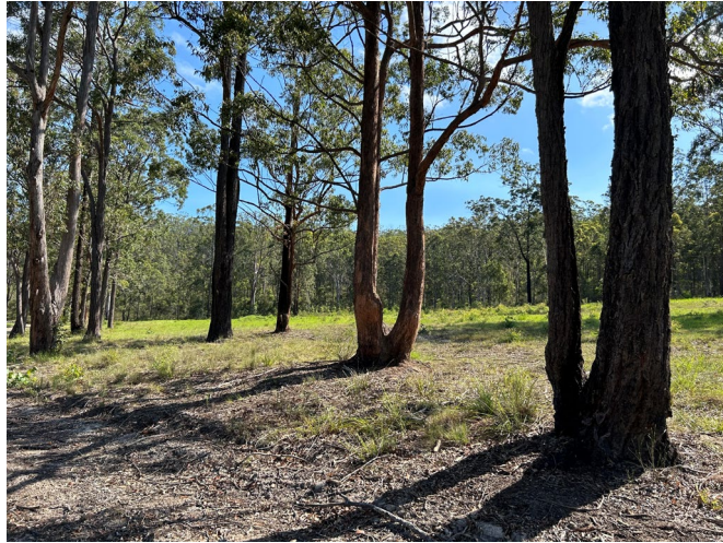
Viewing the proposed office and workshop area