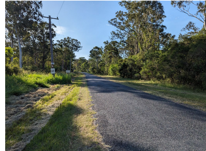
Looking west along Forest Glen Road