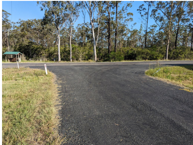
Viewing the intersection

The intersection of Forest Glen Road and The Bucketts Way