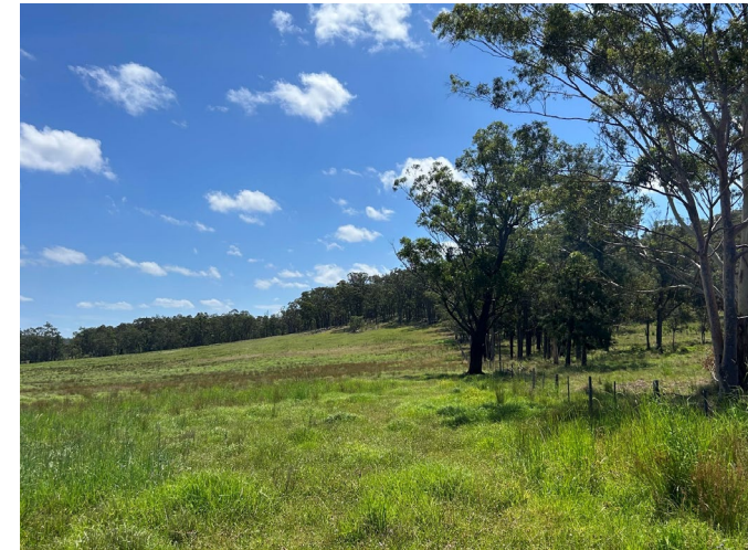
Observing the R30 boundary fence