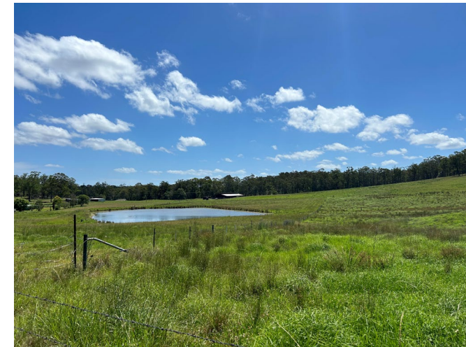
Looking west along the proposed access road