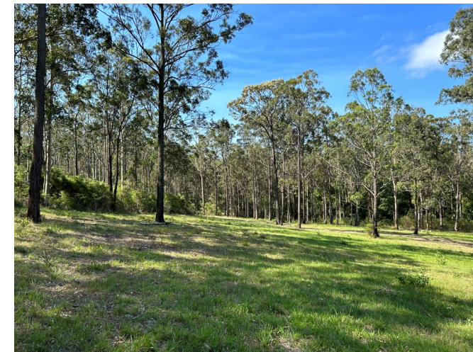
Observing the site of the proposed stockpiling area