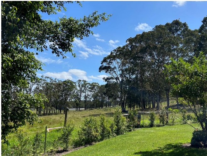
Looking towards to proposed access road from near the R30 dwelling