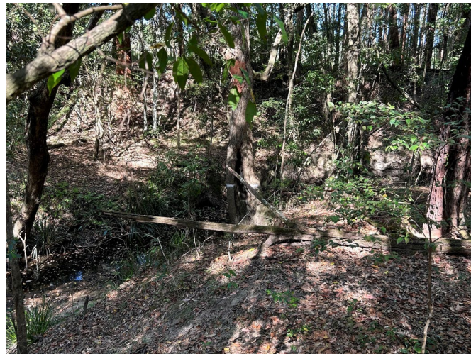
Looking south down Deep Creek

Deep Creek at the site of the proposed creek crossing