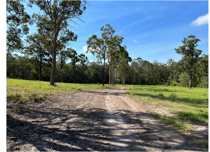
Deep Creek Road