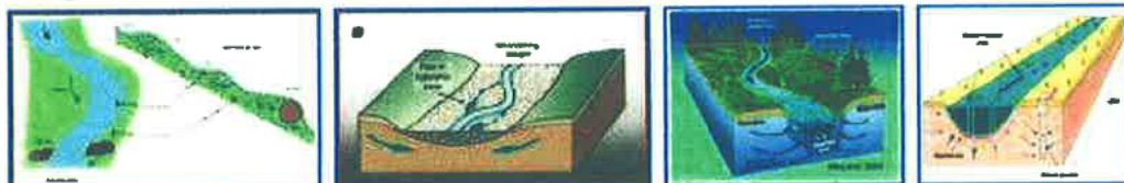
Image results for hyporheic zone - Report images

The hyporheic zone is the transition between aquifer and stream ... The hyporheic zone can play a significant role in nutrient cycling and organic matter ... www.connectedwater.gov.au/.../riverine_ecosystems.html - Cached - Similar