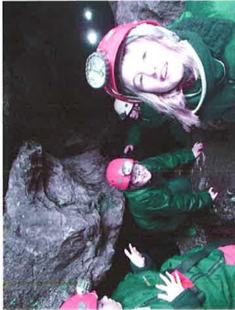
An educated and inspired community

Based on the above outputs, my recommendation to the Commission is to grant approval for the WALLARAH 2 COAL PROJECT! 7