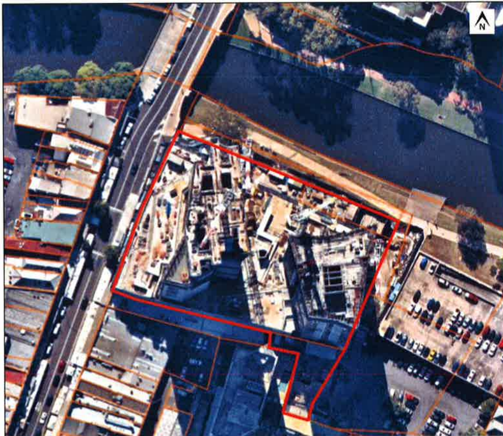
Figure 1: Subject site

The subject site is located at the northern edge of the Parramatta CBD. The site is irregular in shape and it has an area of 6,763 m 2 . The site has frontages to Church Street and the Parramatta River (see Figure 1 ). The eastern boundary of the site adjoins a Council owned car park known as the David Fraser Car Park.